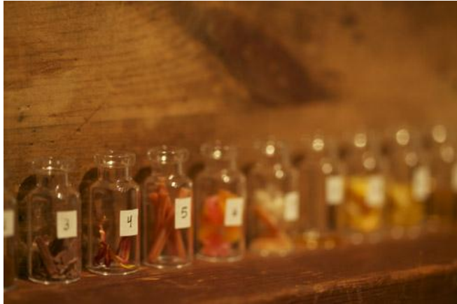
Scent Composition , assemblage, 24"x 18" x 2", 2010